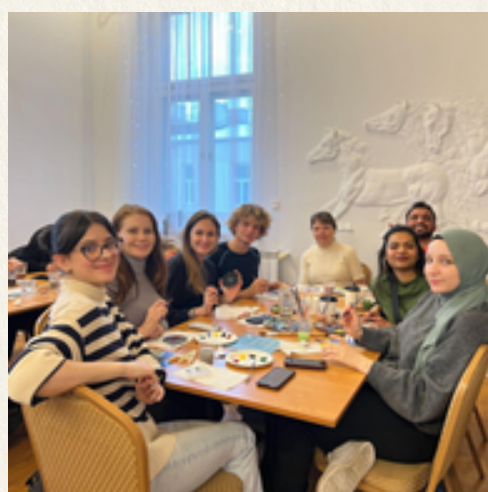
Resource: Dunaj Inštytut Dialogu