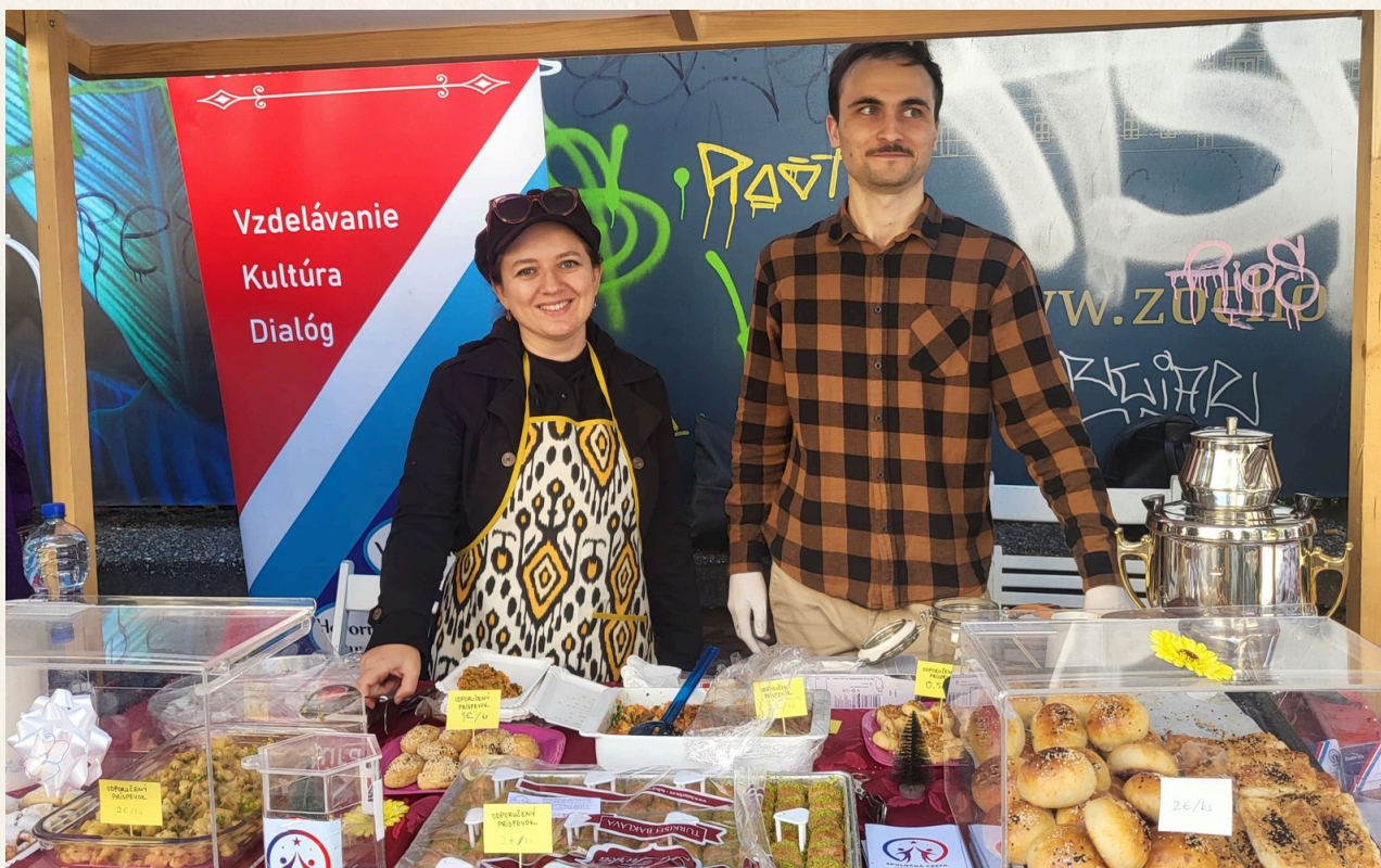
Resource: Spoločná cesta

As you move forward through the toolkit, we encourage you to read each module with an open mind and with a willful spirit. Imagine how the models could be adapted to your own context. Think about your community's needs, its rhythms, and its stories. You don't need to do everything exactly as described. What matters most is your intention—to bring people together in ways that are respectful, welcoming, and human. We hope this toolkit serves not only as a resource, but as an invitation to organize events where everyone feel they belong.