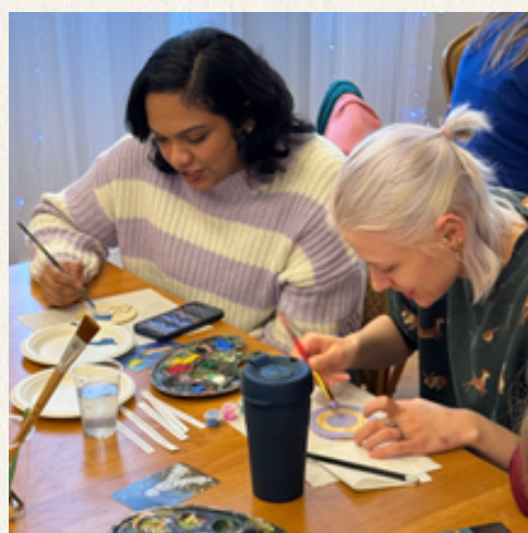
Resource: Dunaj Inštytut Dialogu

Arrange the finished coasters for a small exhibition or photo documentation. Participants can also exchange their coasters as friendship tokens.