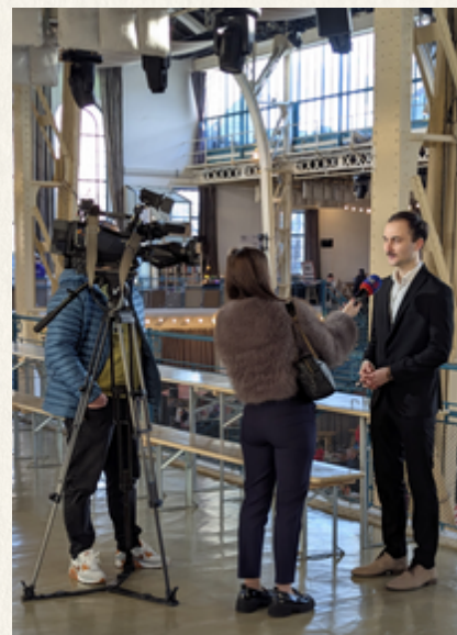
Resource: Spoločná cesta

https://encc.eu/microgrants/cultural-compass-for-refugees-asylum-seekers-and-newcomers