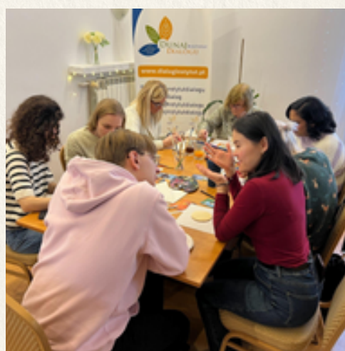
Resource: Dunaj Inštytut Dialogu