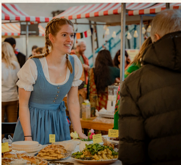
Resource: Spoločná cesta