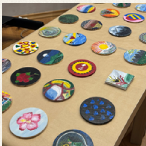
Resource: Dunaj Inštytut Dialogu