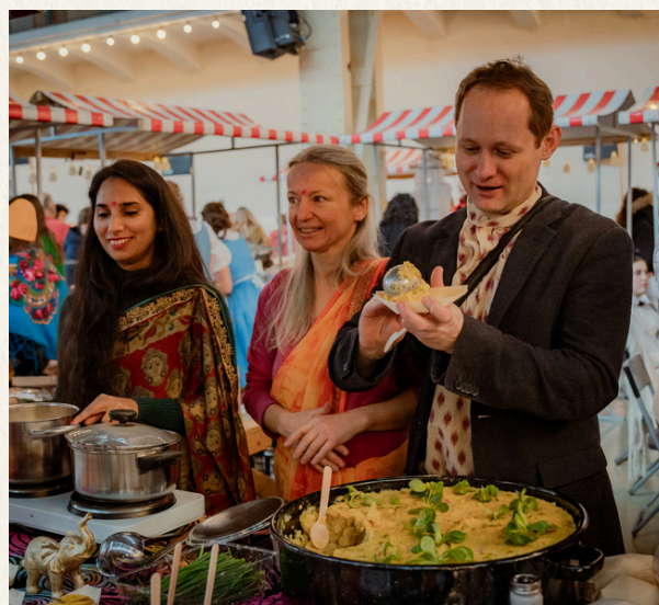
Resource: Spoločná cesta