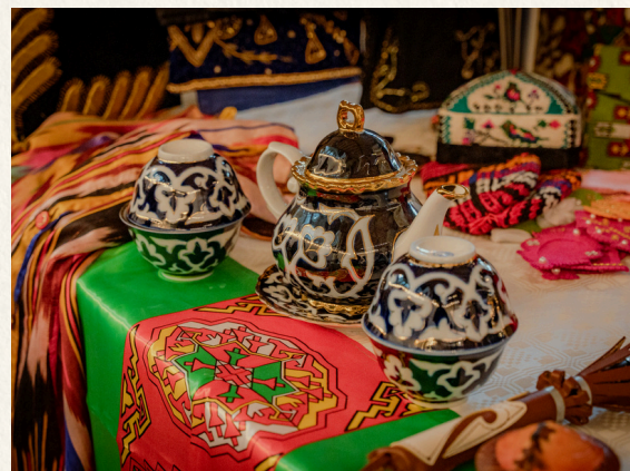
Resource: Spoločná cesta

more than just inviting everyone. It means thinking carefully about accessibility, representation, and emotional safety. It means recognizing and valuing the unique contributions that each person brings, and creating spaces where people are not only present, but genuinely engaged. Over the next five modules, you will find different approaches to inclusive community building.