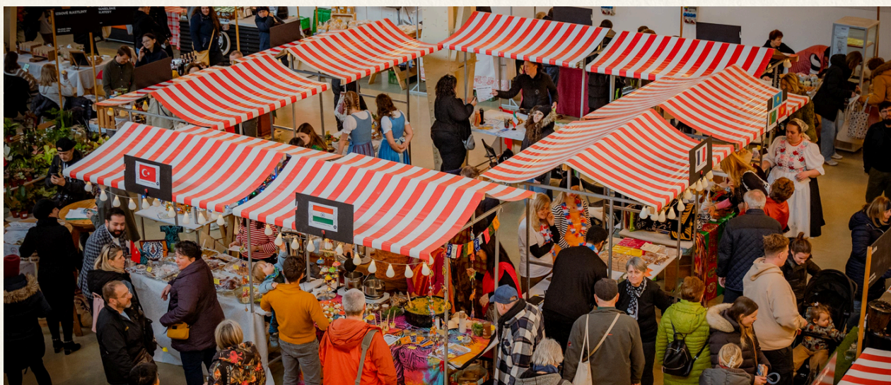
Resource: Spoločná cesta