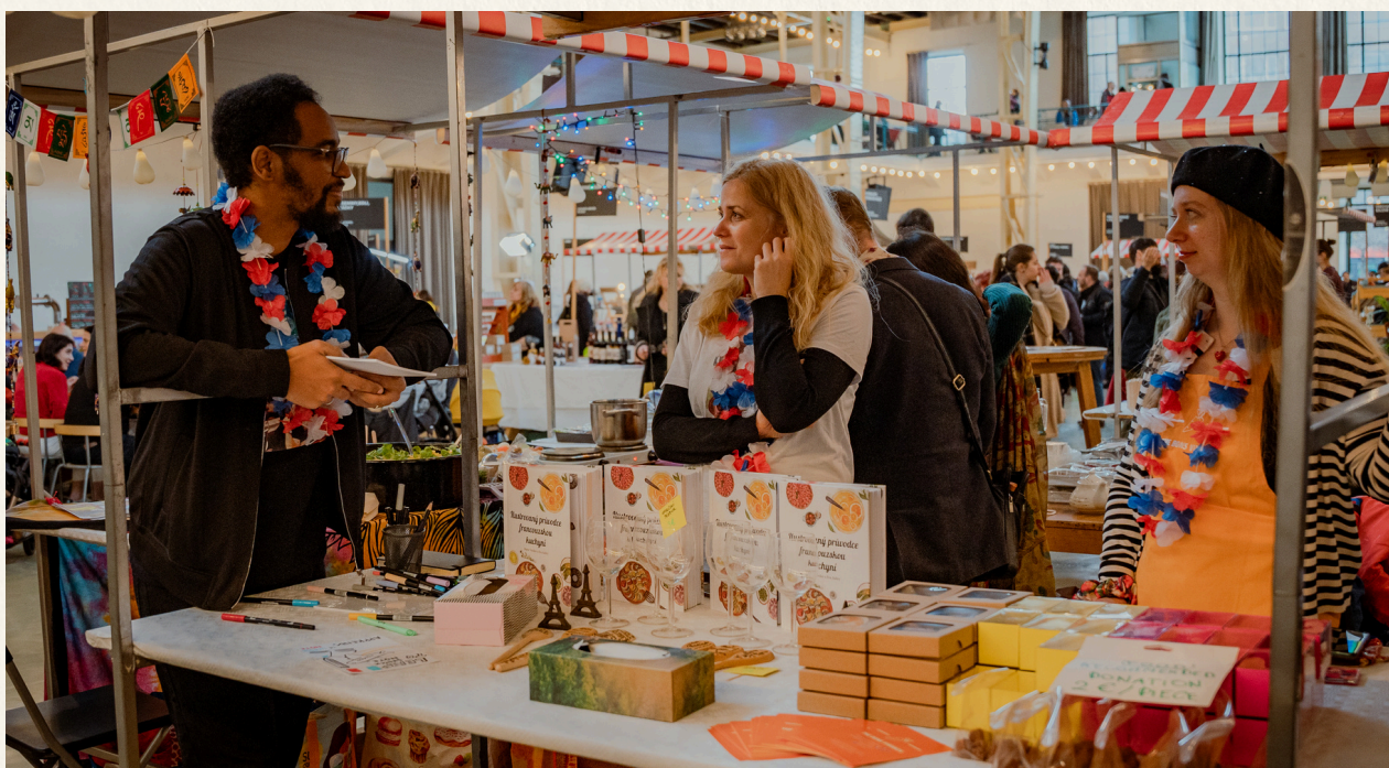
Resource: Spoločná cesta