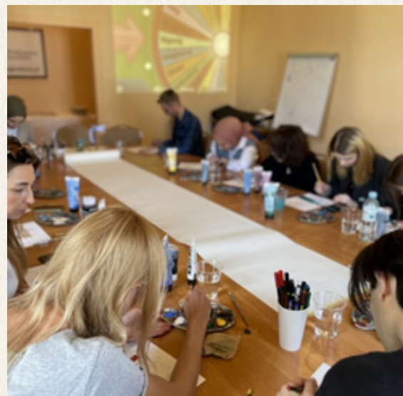
Resource: Dunaj Instytut Dialogu