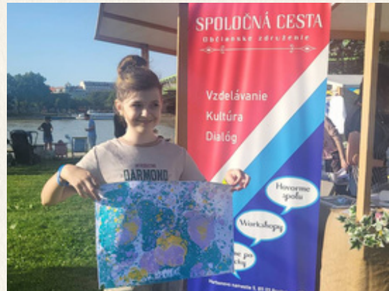
Resource: Spoločná cesta

have the power to shape the way people feel about themselves and each other. They create the conditions for friendship, dialogue, collaboration, and shared memory. For migrant workers and newcomers, such events can be the first step toward feeling at home. This module is designed as a starting point—a wide introduction to the values, principles, and formats behind inclusive event planning.